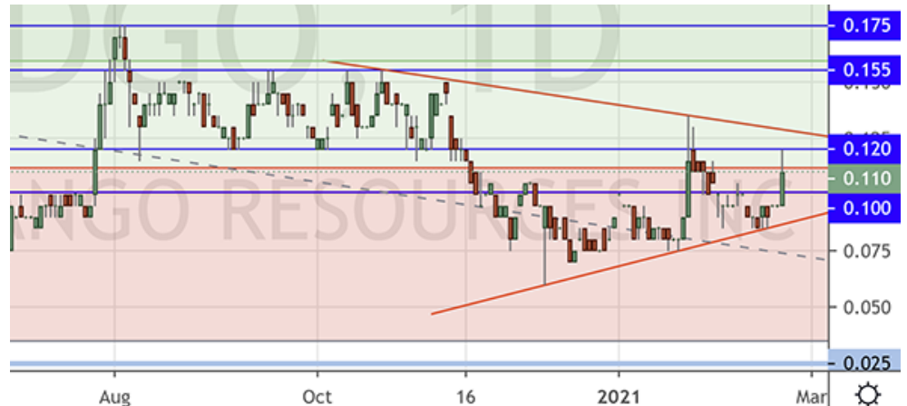
DGO Chart by TradingView

On Thursday DGO announced an update which included hiring a new IR group, Core Consultants (Pty) out of the UK at a cost of $40,000USD per month for 3 months. The stock traded 1.2Mil shares on Friday hitting .12 closing at .11 on the TSX Venture. I would predict a financing is coming. Are new highs coming? The big $$ exposure could help. Time will tell.