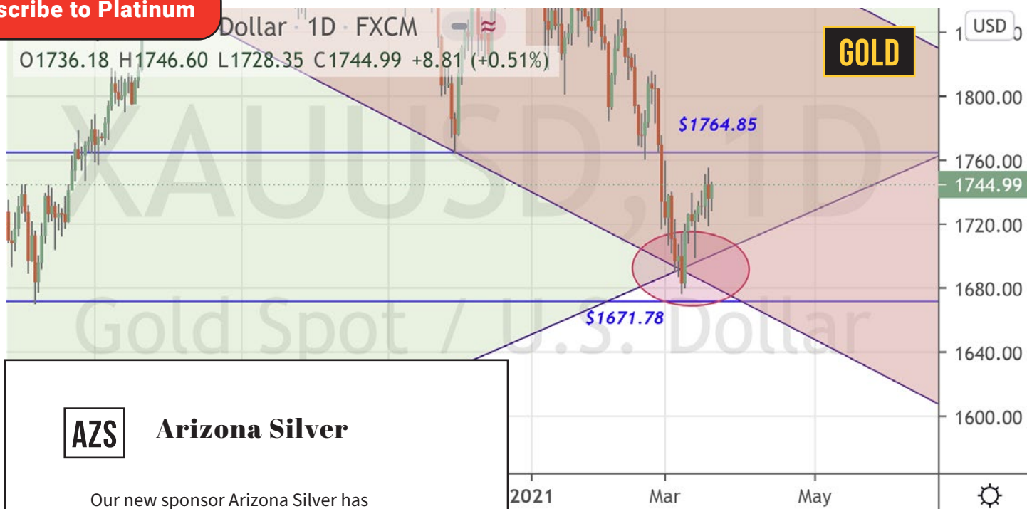
Spot Gold Chart by TradingView