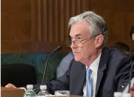
CHAIR POWELL'S MARCH 17TH CONFERENCE TRANSCRIPT

MARCH 17TH CNBC: HERE'S WHERE THE FEDERAL RESERVE SEES INTEREST RATES, THE ECONOMY AND INFLATION GOING