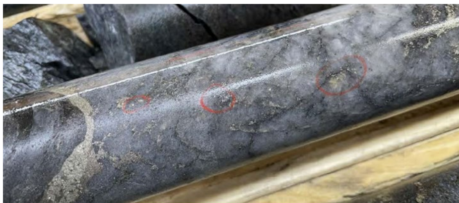
Visible Gold in Core

method. This is done in Australia and thousands of samples are being shipped. I would imagine there should be news coming fairly soon.