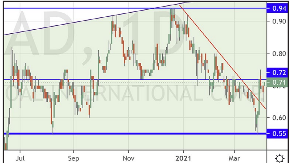
CAD Chart by TradingView

C olonial Coal's [CAD - TSX-V] chart is looking more positive. On March 25th it bottomed at exactly 55 cents which is the August 7, 2020 low on a previous dip. On March 26th buying flooded in, the stock popped .11 to close at .73 on 933,673 shares traded! There were 3 large offers that were sitting there for a while and they were all taken out. Someone selling through CIBC dumped 1/2 million shares (large offers) and several houses bought them all in one day (Haywood/Scotia/TD). Very positive in my opinion. From the latest INK Research report, David Emri has bought 673,000 shares between Feb.26th and March 25th. He controls 18.9M shares of Colonial Coal. Hopefully this is the start of a new uptrend as we wait for a possible sale.