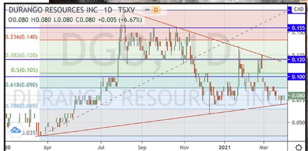
DGO Chart by TradingView